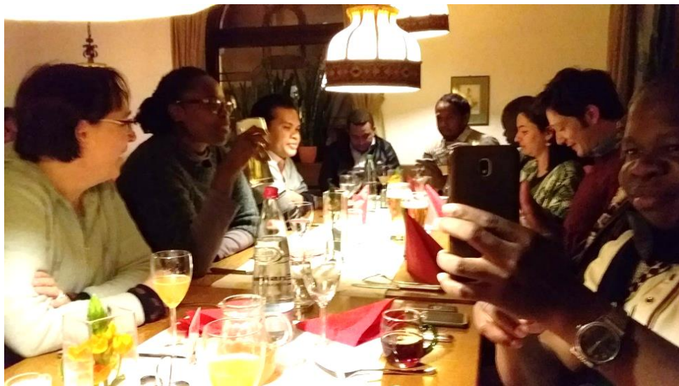
Dinner at the Gasthof Sonne