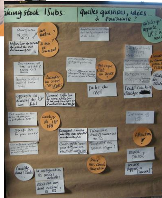
Results on taking stock "ISubs"